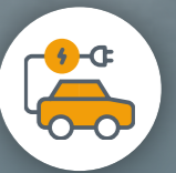
EV ready parking