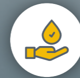
Low water flow