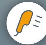
Staff shower facilities