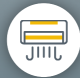
New, highly efficient HVAC system