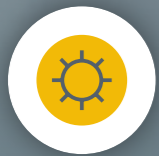
Warehouse roof lighting

This highly sustainable building minimizes environmental impact with energy-efficient LED lighting, natural lighting, a modern HVAC system, and low-flow water fixtures. It promotes green commuting with bike storage and staff showers, while EV-ready charging points support a cleaner future. Every feature is designed to reduce the carbon footprint and boost efficiency.