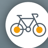
External bicycle storage